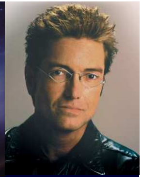
DAVID MEECE CONCERT Saturday, July 11, 2009

Simple Solutions for Tough Times ~Living By Faith~ "...my righteous one will live by faith" Hebrews 10:38